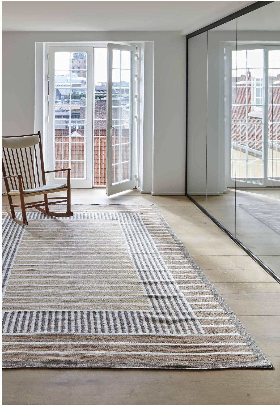
HEMP COLLECTION | nougat rose