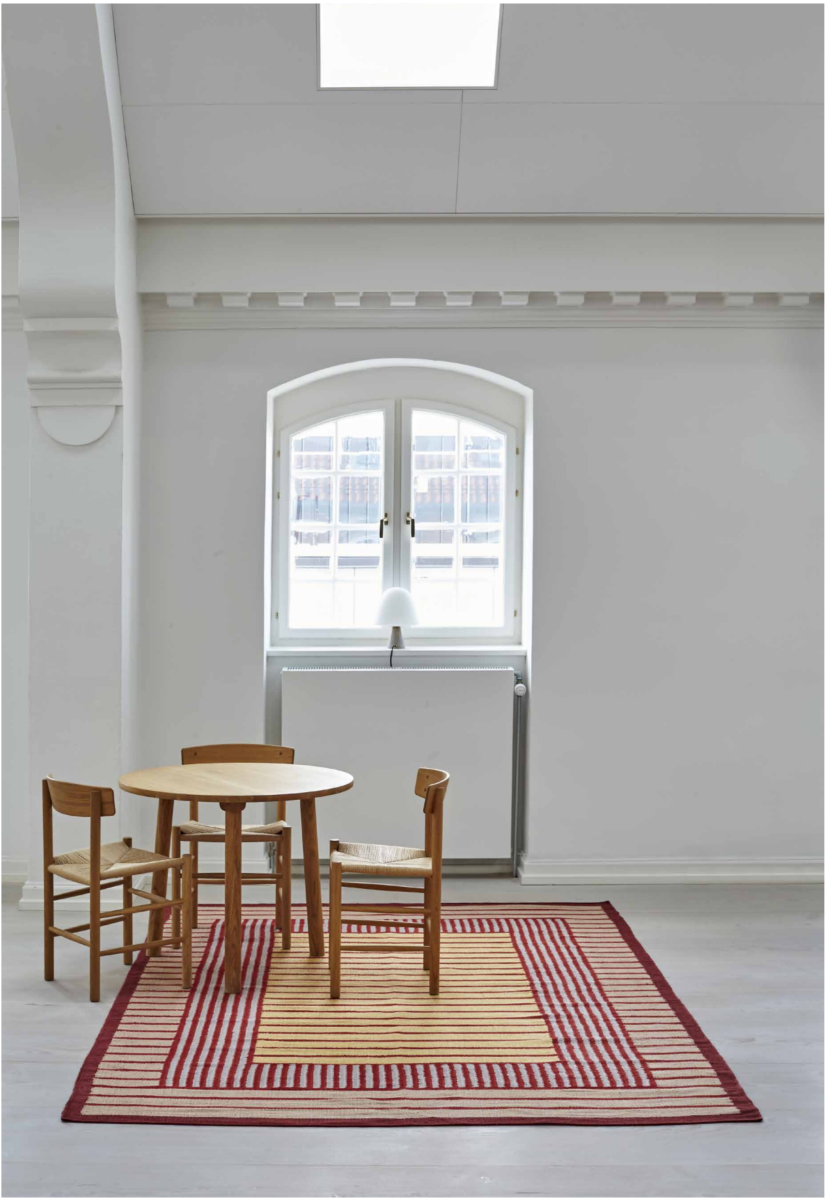
HEMP COLLECTION | red