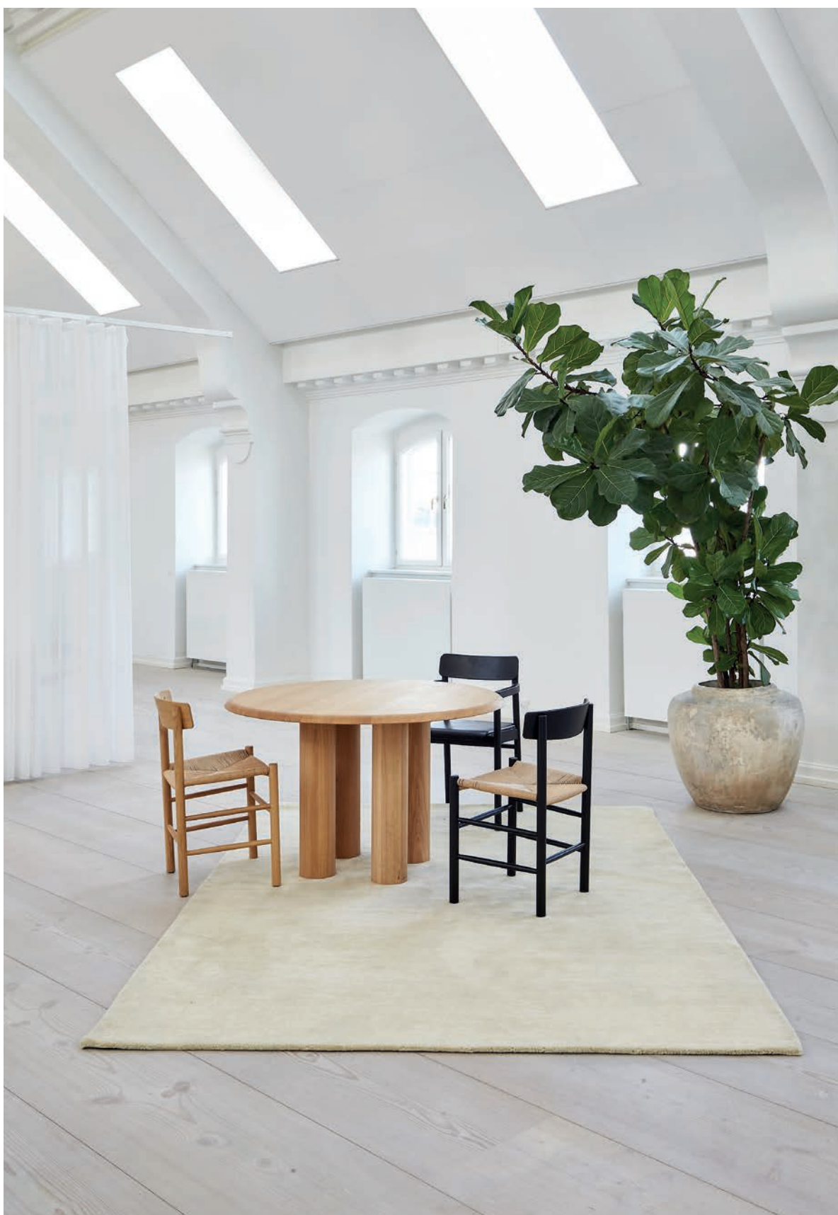
REPEAT | Pastel yellow