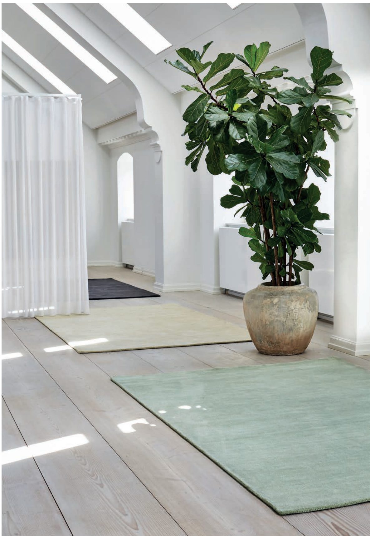
REPEAT | Pistachio, pastel yellow, graphite